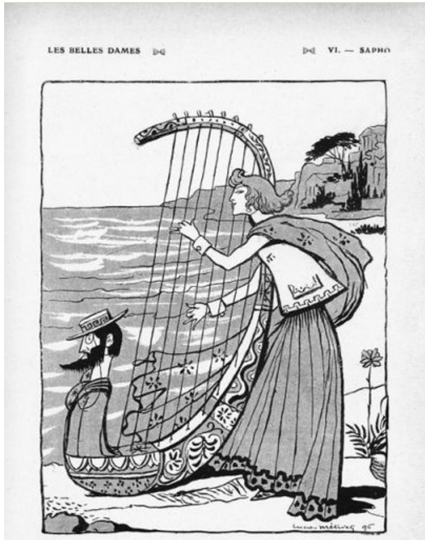
Lesbian Decadence: Representations in Art and Literature of Fin-de-Siècle France

“In popular society, however, lesbianism was flaunted,” he continued. “Some paintings, no doubt, shocked the public in the early 1900s.”