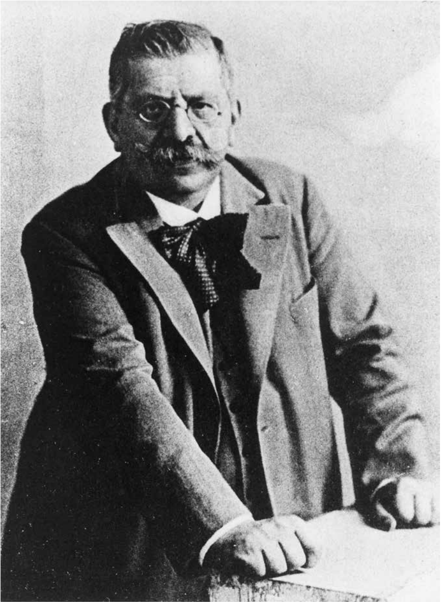
FIGURE 2 MAGNUS HIRSCHFELD

The German-Jewish physician and sexologist Magnus Hirschfeld emerged as the most important face of homosexual activism in the early twentieth century. From 1897 until 1929 he served as the chair of the Scientific-Humanitarian Committee (WhK). This chapter examines the emergence of the early LGBTQ rights movement in Germany, in which Hirschfeld played an important role. It also considers the complicated interplay that developed among science, same-sex identities, and LGBTQ politics at the end of the nineteenth century.